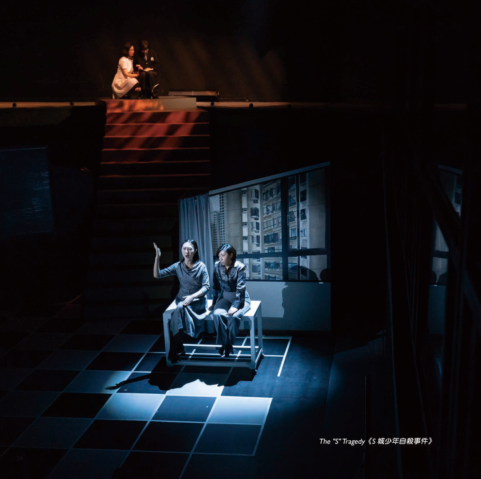
The "S" Tragedy 《S 城少年自殺事件》