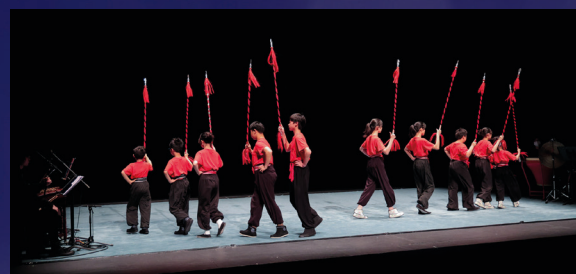
The performance by the students of Cantonese Opera Youth Programme (COYP). 粵藝青少年導修計劃學生的戲曲選段演出。

dance open classes, film and television screenings, and guided tours for immersive performing arts activities. Furthermore, visitors were able to go backstage to discover secrets from behind the scenes, including stage design, props and costume making, as well as to enjoy stage effects exhibitions and indulge themselves in the world of the performing arts. The "On Stage @ HKAPA Digital" of the Academy Library also allowed visitors to step onto different stages virtually and take digital photos of themselves as characters in Academy productions. 🎭