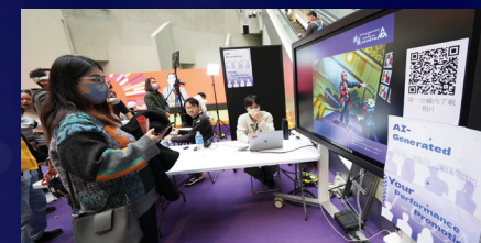
Members of the public created their own AI portrait on the day and had fun. 透過人工智能技術讓公眾化身成為台上的主角。