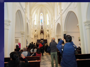
An enjoyable visit at the stunning Béthanie Landmark Heritage Campus. It has housed the training facilities for the School of Film and Television of the Academy since 2006. 市民興致勃勃參觀伯大尼古蹟校園，伯大尼自二零零六年起成為電影電視學院培訓設施所在地。