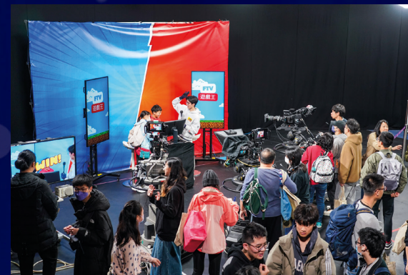
Visitors watched demonstrations of motion capture, special effects and virtual camera production, as well as trying out the techniques. 公眾觀看電影電視學院學生作捕捉、特效和虛擬攝像機製作示範，並親身體驗電影互動製作技術。