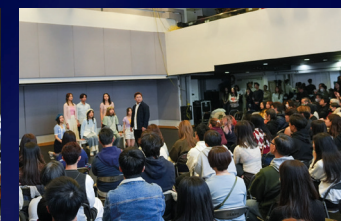
Musical jukebox by students from the School of Drama. 戲劇學院學生載歌載舞，展演音樂劇歌曲。