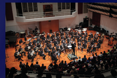
Performance by the Academy Concert Band was well-received by the audience. 演藝管樂團演出，深受大眾歡迎。

精彩的藝術三月之始，演藝學院於三月三日集合六大學院師生和部門，向逾8,500位市民大眾於年度開放日呈獻不同類型的表演藝術活動，逾百場免費活動於灣仔本部及伯大尼古蹟校園舉行，更融入人工智能與藝術科技元素，承傳傳統藝術之美同時不斷創新。