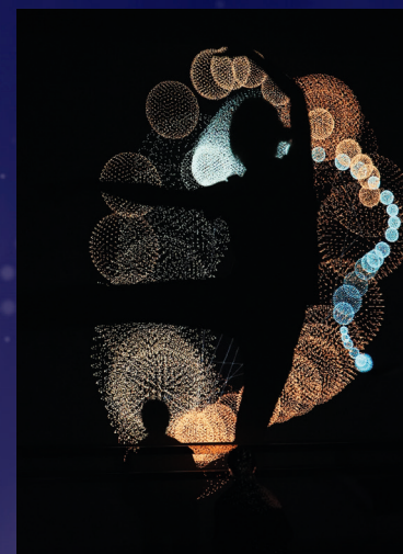
Dance students showcased their experimental work through extending their body with creative movements and thinking beyond traditional dance choreography. 學生運用科技創作實驗性的舞蹈，以創意的形體動作，跳出傳統編舞的框框。