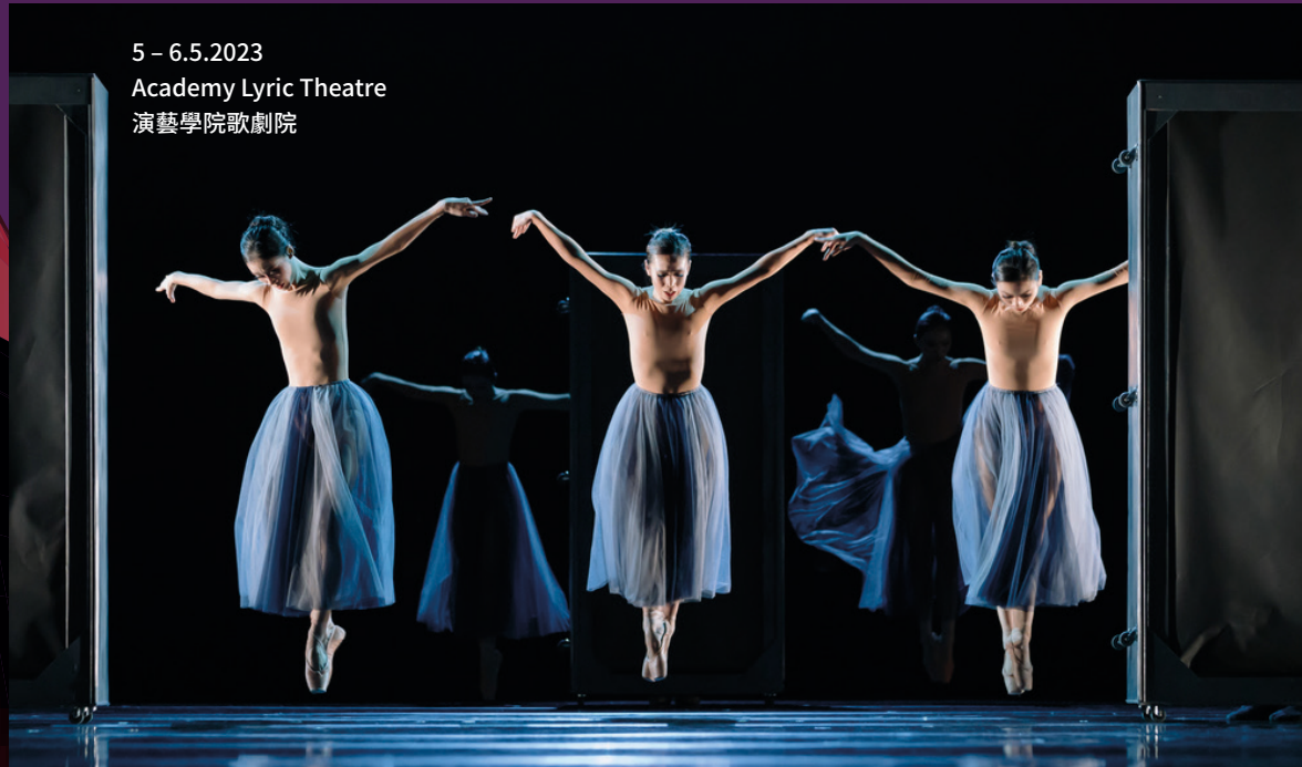
5 - 6.5.2023 Academy Lyric Theatre 演藝學院歌劇院