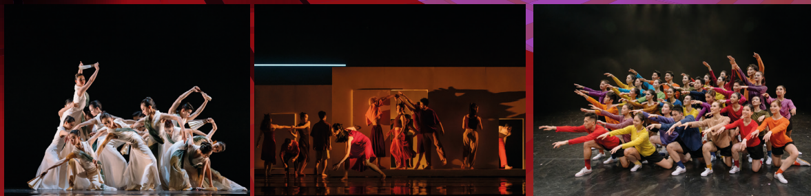
All dancers are School of Dance students, while most members of the production team are from the School of Theatre and Entertainment Arts. 所有舞者均為舞蹈學院學生；製作團隊大部分成員為舞台及製作藝術學院學生。Photos by 拍攝：Kontinues

"...witness three new choreographies and one re-run, ranging from ballet to Chinese dance to contemporary dance and students' collaborative choreographies created exclusively for the Academy's dance production. Each piece is a unique expression of human experience, pushing the boundaries of dance and showcasing the versatility and creativity of our talented dancers."