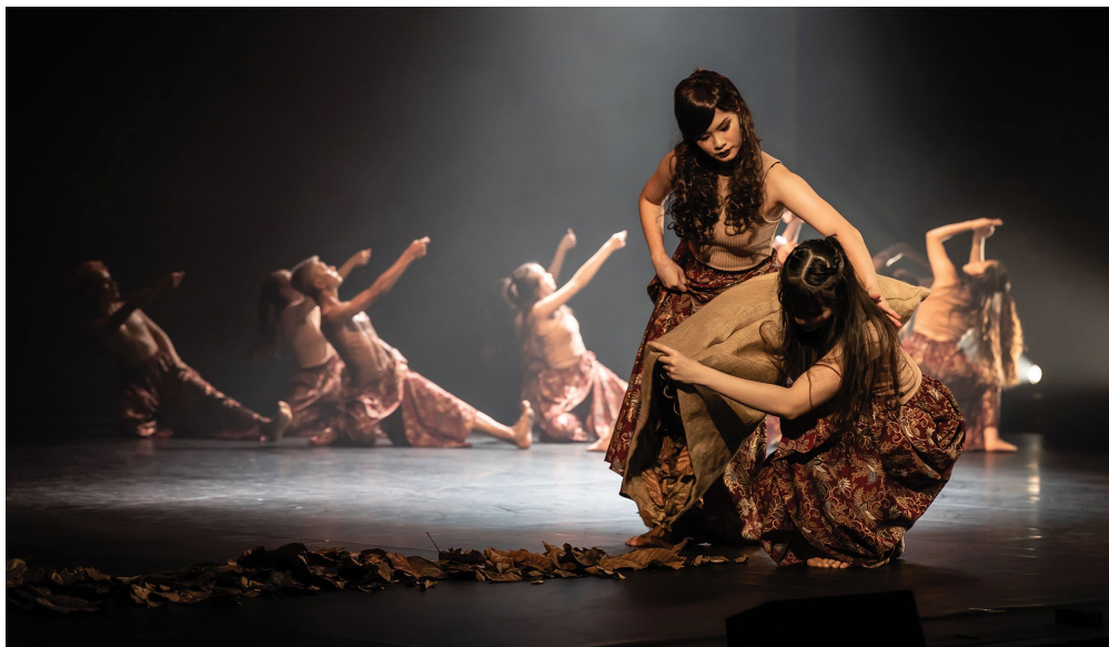
© LASALLE College of the Arts

Academy Performance Screening 學院錄像舞台表演 III 20.06.2022 (MON) 7:00PM – 8:30PM