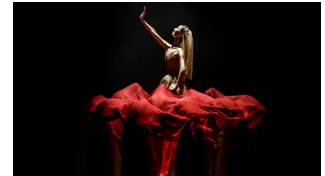
© Shanghai Theatre Academy, College of Dance