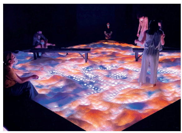
Dance students rehearsing for the experiential dance performance OBSERVE at the installation. 舞蹈學生於裝置上排練《動・觀・靜》體驗式舞蹈表演。