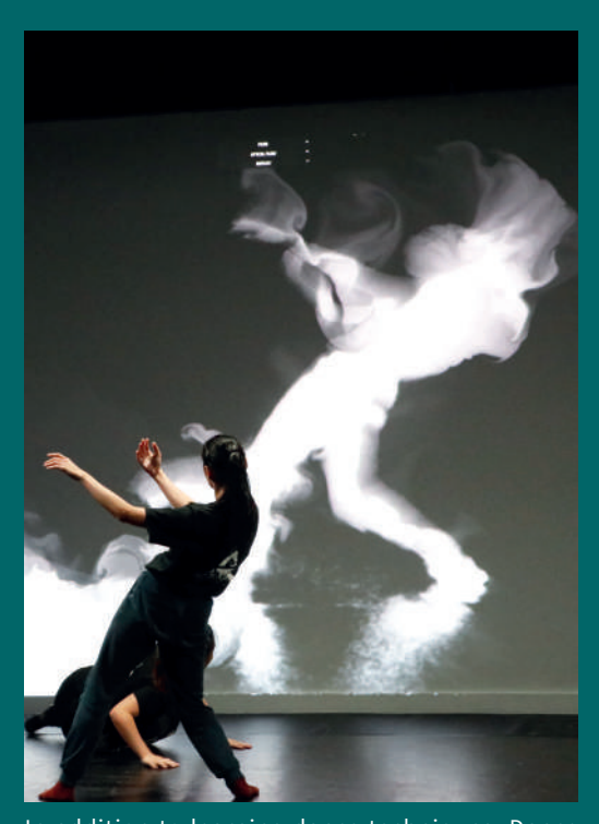
In addition to learning dance techniques, Dance students are often exposed to technology in class so that they can acquire the skills for integrating technology into dance. 除了學習舞蹈基本功,學生亦經 常於課堂上接觸科技,以掌握其於舞蹈上的運用。

為了配合發展,學院在軟件和硬件上花了不少功夫,例 如設置舞蹈科學實驗室,利用儀器收集學生體嫡能數據 進行評估和分析,再調節訓練時間。軟件方面,學院對 於培育人才早有準備,「我們其中一位舞蹈科學的講師 是我們的舞蹈藝術碩士生,她畢業後到了英國修讀舞蹈 科學碩士學位,隨後留英工作。現時她已學成回流,在 學院傳授相關知識。」