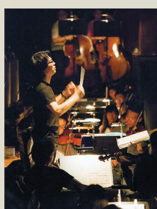
Rehearsal photo. 排練照片。

「我還記得第一次站在天橋上遠眺演藝學院時的興奮心情,有種夢想成真的感覺。」但開學不久便察覺自己的不足。「大部分同學自小已接受了聆聽訓練,他們也相當熟悉樂理。這些方面我跟他們的程度差很遠。」其後為了報讀演藝學院的全日制課程,於澳門唸中學的他亦