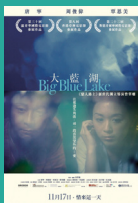
Big Blue Lake Hong Kong Film Awards Best New Director