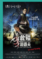
Vampire Cleanup Department