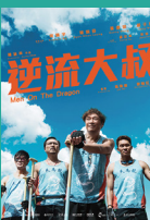
Men on the Dragon The Tripod Award Best Film Hong Kong (China)