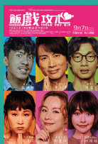
Table for Six