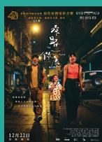
The Narrow Road Hong Kong Film Critics Society Best Director