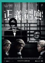
The Sparing Partner Hong Kong Film Awards Best New Director