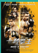
One Second Champion