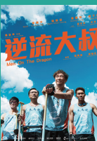
Men on the Dragon

The Tripod Award Best Film Hong Kong (China)