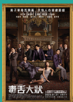
A Guilty Conscience