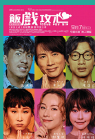
Table for Six