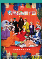
Over My Dead Body