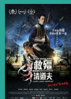
Vampire Cleanup Department

The Tripod Award Best Film Hong Kong (China)