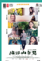
Far Far Away

Hong Kong Film Critics Society Best Director