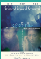
Big Blue Lake