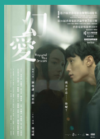
Beyond The Dream