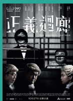
The Sparing Partner