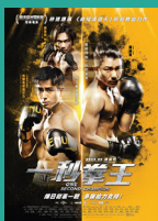
One Second Champion