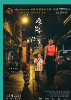
The Narrow Road

Hong Kong Film Critics Society Best Director