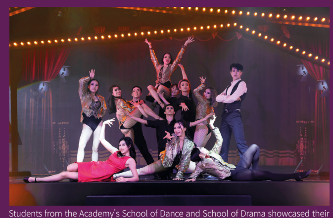
talents with wonderful performances at the Ball. 舞蹈學院及戲劇學院的學生為舞宴落力演出,大展才華。