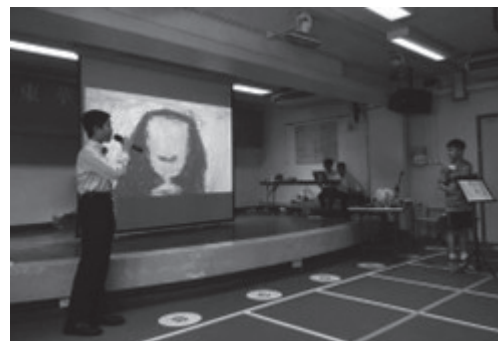
Composition creative collaboration project 作曲創意合作活動