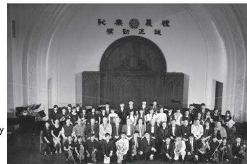
"Young Music Makers from Shanghai, Hong Kong, Macau and Taiwan" Joint Broadcast Concert in the National Taiwan Normal University 國立台灣師範大學演出 "兩岸四地琴音飛揚" 節目