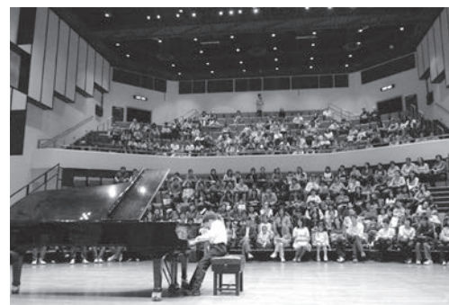
Piano Solo Performance in the Academy Concert Hall 演藝音樂廳鋼琴獨奏