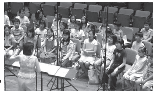
Choir in a recording session 歌詠團參與錄音製作