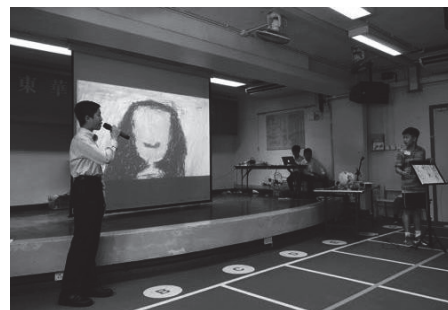
Composition creative collaboration project 作曲創意合作活動