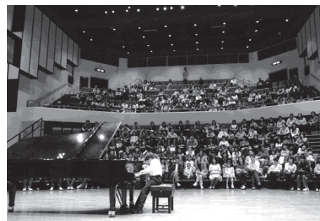
Piano Solo Performance in the Academy Concert Hall